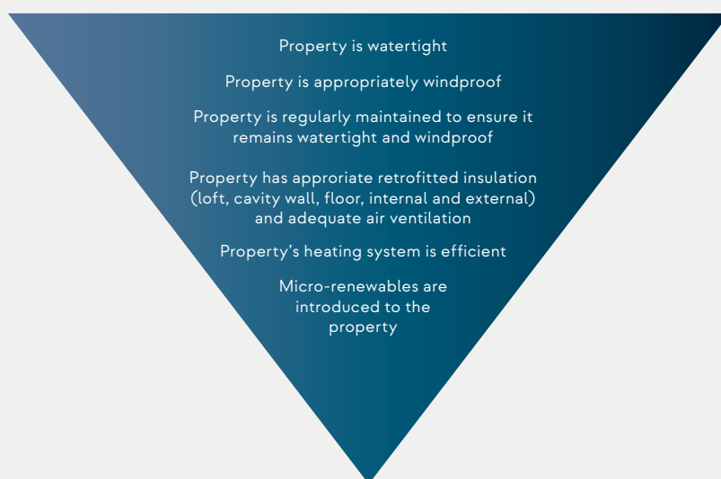
Figure 1 Hierarchy of retrofit: taking a fabric first approach

As Scottish Government has recognised, a good standard of energy efficiency means we use less energy, reducing greenhouse gases and, critically, helping households to save on their energy bills and reducing rates of fuel poverty. 5